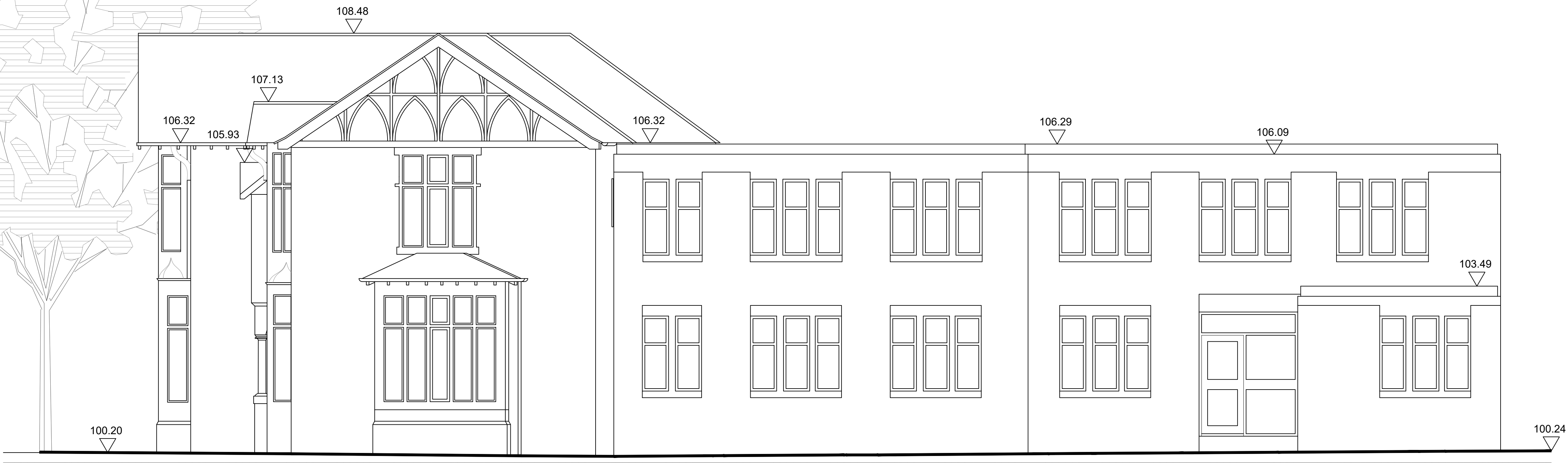
Side Elevation Scale 1:50